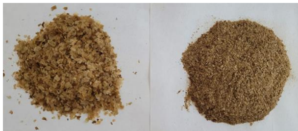
Figure 1. Non-sieved and sieved CSS samples.

pretreatments. CSS pretreatment was carried out in 200 mL Duran bottles, and sieved CSS sample was mixed in acid and alkaline solutions and then autoclaved (HiClave HV-25 autoclave, HMC, Japan) at 121 °C. After removal from the autoclave, the liquid portions of the samples were filtered through a coarse filter paper, separated for glucose determination, and filtered through a syringe filter with a porosity of 0.45 µm before analysis.